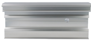
MWO 222 TR Aluminium Track Length: 2.5m Quantity: 1