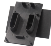
MWO 222-6 End Cap Quantity: 2