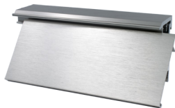
MWO 222 CVR Track Cover Length: 2.5m Quantity: 1