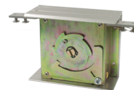
MWO 222-8 Winding Spring Coil Closing direction: Pull to left / right Quantity: 1