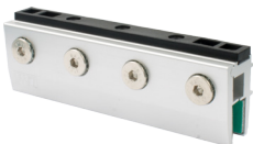
MWO 222-3 Roller Glass Clamp Quantity: 2