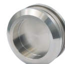
MWO 020A Round Recessed Knob Finish: SSS / PSS Quantity: 1